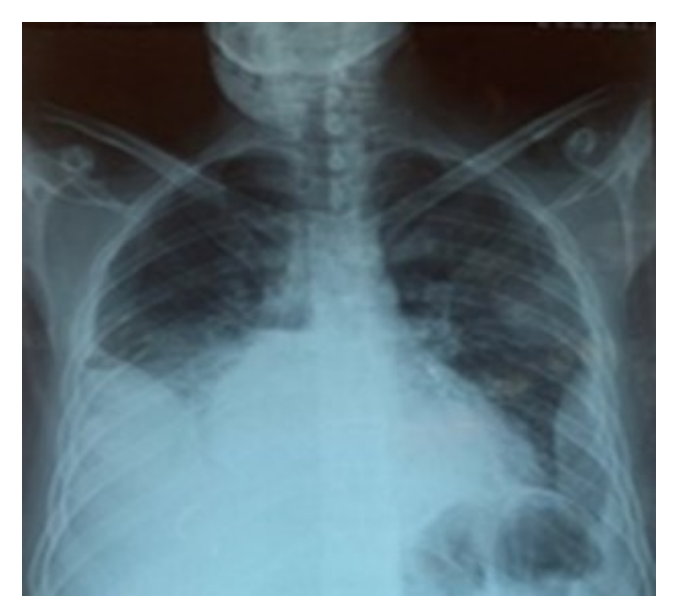
FIGURE 3. Watery opacity occupying the lower 2/3 of the left hemithorax, blunting of the right cul de sac and cardiomegaly.

In addition to resuscitative measures, treatment includes a thoracic drainage thoracic drainage with evacuation of two liters of pus and bacteriological samples, a probabilistic antibiotic therapy based on amoxicillin+clavulanic acid (1 g/8 hours) associated with 5-nitroimidazole (500 mg x 3/d) and gentamicin (160mg/d) readjusted according to the results of the antibiogram.