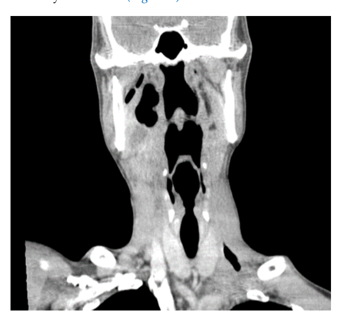
FIGURE 1. Collection under the left mandible with infiltration of the right parapharyngeal space, the site of a poorly limited collection extending to the homolateral submandibular and under chin spaces homolateral.

A 33 years old chronic smoker was admitted to the emergency room with septic shock, who was questioned and found to have dental pain and to be taking non-steroidal anti-inflammatory drugs. On physical examination, he was dyspneic, febrile with a trismus, poor oral hygiene, and moderate left submandibular non-fluctuant swelling that was firm, erythematous, and warm to palpation. The initial biological workup showed hyperleukocytosis, high CRP. The CT scan of the cervicothoracic cavity reveals a presence of a hypodense anterior medial collection which leaks, extends with a sub-mandibular collection (Figure 1), bilateral pleural effusion and pericardial effusion (Figure 2), hence the performance of a frontal thoracic radiograph, which showing pleurisy of moderate severity on the right and of low severity on the left (Figure 3).