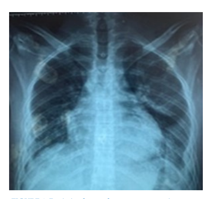
FIGURE 4. Drain in place, pulmonary re-expansion.